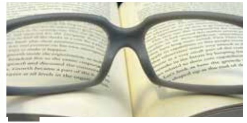
Accura Xtreme (frame) and Accura ClearVue (lenses)