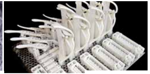
Accura Xtreme White 200