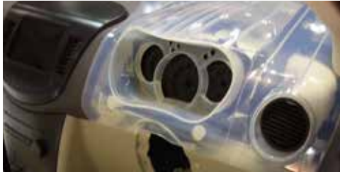
Various Accura materials for form and fit tests of a dashboard

Plastic and composite parts made from Accura SLA materials are the industry's gold standard for accuracy, providing excellent resolution, surface finish and dimensional tolerances. Accura SLA materials offer the broadest choice of materials in 3D printing and can easily be optimized for specific prototyping, casting, tooling and direct manufacturing applications.