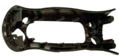
Accura ABS Black

The wide range of Accura engineered materials offers the toughest and the highest quality parts to meet a broad range of commercial and production applications.