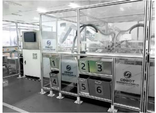
Smart Mushroom sorting system