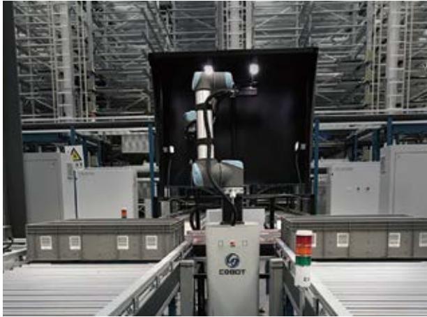
Robotic sorting system for an E-commerce company