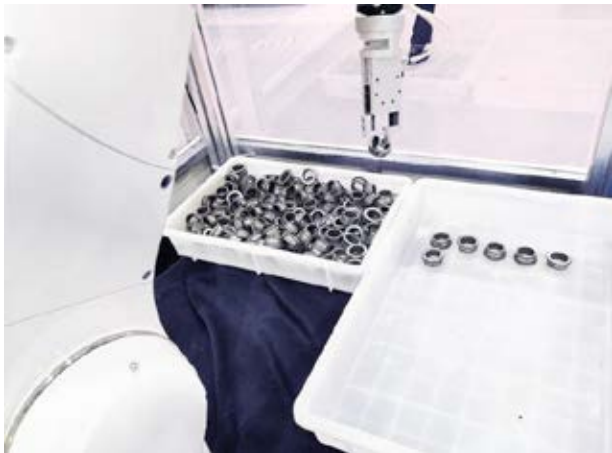
Disordered parts sorting system