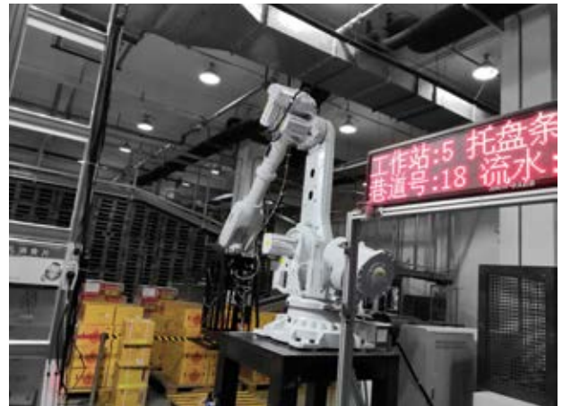
Visually guided robot palletizing system